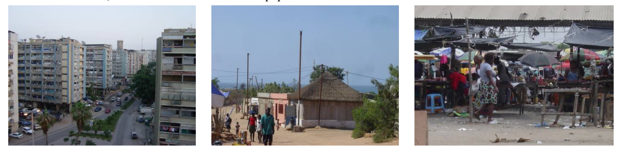
Figure 2. The three locations used in this study: the left picture shows the Maianga neighborhood, where the cybercafés are located; the middle picture shows the Bairro Pedelé neighborhood; the right picture shows the Estalagem marketplace.

In debriefing, interviewers all agreed that they preferred using the handheld over the paper. The main advantage of the handheld was its lighter weight; rather than carrying dozens of paper surveys, interviewers only had to carry two handhelds (one for use, one for backup). One interviewer