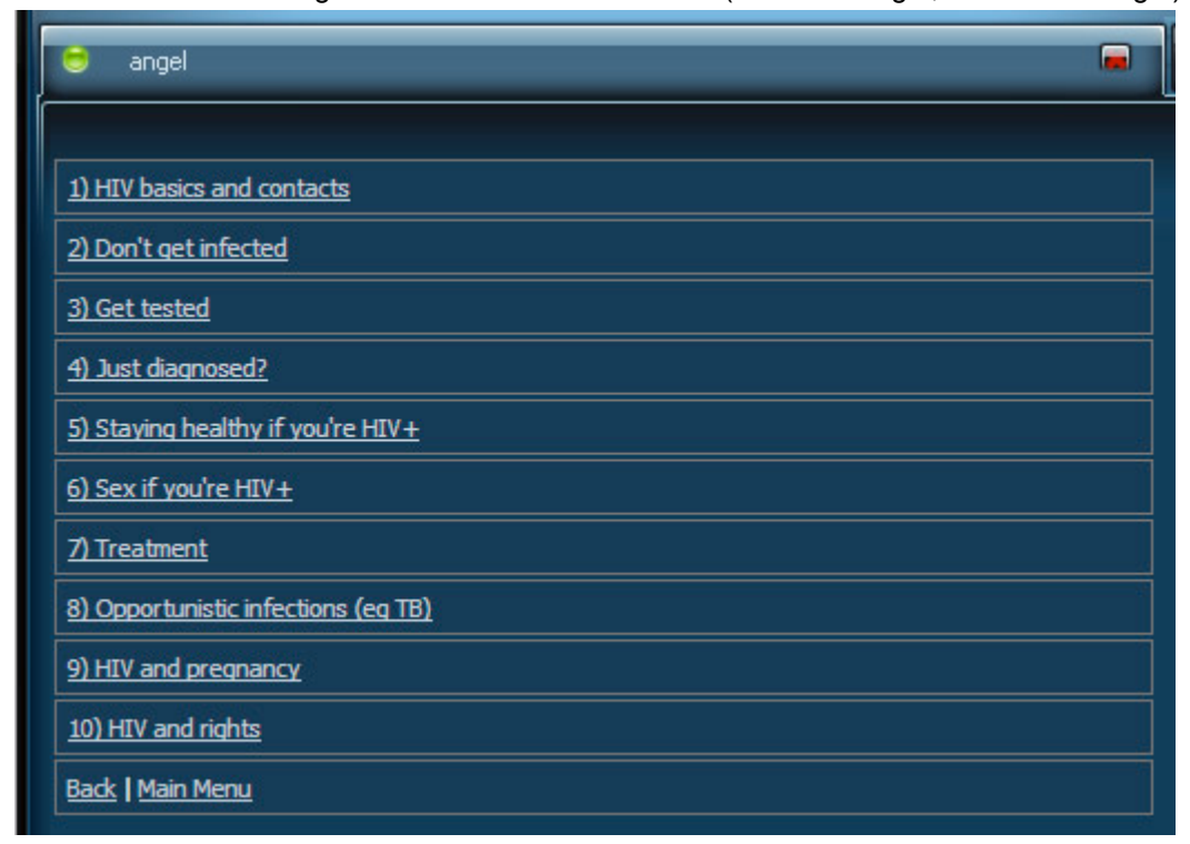
Figure 1: HIV directory on MXit

MXIt users can add Angel as a MXit services contact. (Number: Angel; Nickname: Angel)