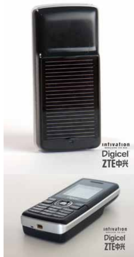
Digicel solar phone

Digicel has taken a different route from Safaricom in that they will subsidise the cost of the solar handset for their subscribers. Digicel expects that the increase in ARPU that will result from the distribution of solar phones will justify their upfront investment.