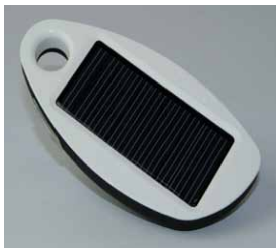
Solio: Mono solar charger

The Solio charger will be launched in partnership with Digicel in Q4 2009. Digicel plans to subsidise the cost of the charger and offer it to their consumers at a discounted price.