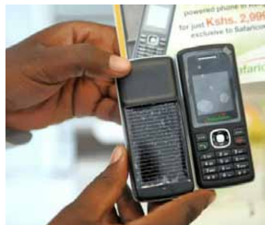
The 'Simu Ya Solar': solar phone launched by Safaricom