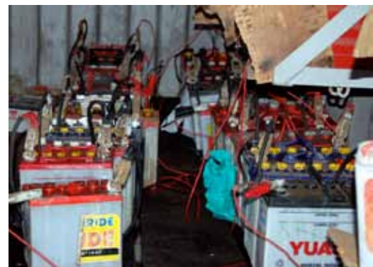
Car batteries being charged for household use, or for entrepreneurs who will provide distributing mobile charges to others (Kibera, Kenya)