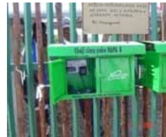
Safaricom charging station

Safaricom offers free mobile phone charging to consumers by adding charging docks to their base stations in off-grid areas. The charging dock is attached to an extension cable, and people can plug in their own phone chargers. A security guard on site controls the usage of the dock, to prevent excessive power demand on the base station equipment.