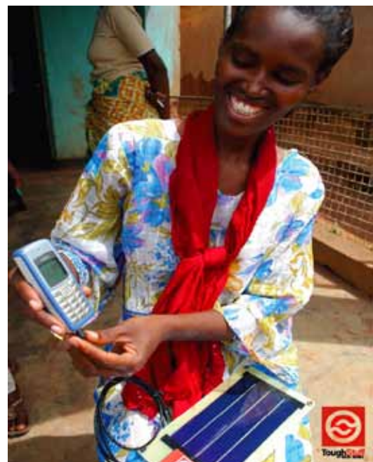
Toughstuff's solar panel

These examples suggest an exciting commercial opportunity exists for mobile operators. Even when applying conservative estimates about the increase of ARPU resulting from charging solutions (10%), and the average airtime spend of the off-grid customer (US$4 per month), for 500 million off-grid consumers the expected increase in direct revenues to operators would total US$2.3 billion per year. (2)