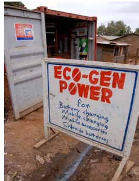
Sign and entry to the Eco-Gen Power charging shop (Kibera, Kenya)

Value Added Services Product Manager, Safaricom