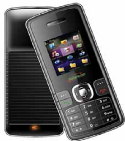
Safaricom solar phone

In the Safaricom example, the extra cost of the solar panel is paid for by the consumer. The solar phone costs approximately KES 1200 (US$15) more than a standard low cost phone, but a consumer will save on charging costs thereafter. The operator does not subsidise the handset.