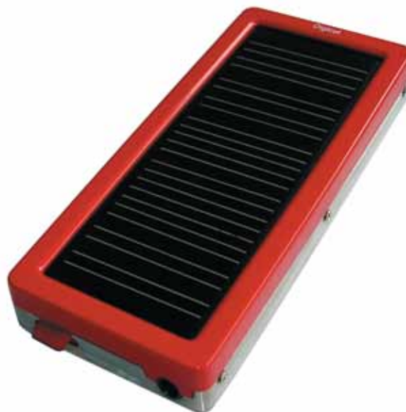
Digicel: RMK solar charger

In this example, Digicel has subsidised the cost of the charger, providing it free of charge to the consumer or at a reduced price. This was done on the premise that the use of the charger increases the consumer's ARPU, thereby repaying their investment.