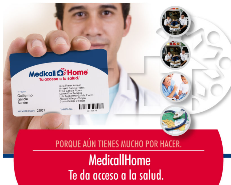
Figure 2. MedicallyHome “Tarjeta medico”

Healthline is now exploring the potential to generate revenue from its referral service, by developing a mobile-phone-based system for issuing electronic prescriptions and referring patients. The company envisions charging callers for the ability to refer them automatically to clinics and physicians, and for issuing prescriptions via SMS.