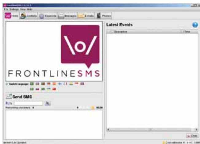
Figure 9: SendConsole screen – compilation and sending of group messages 53

FrontlineSMS does not require an internet connection for either the administrator or the subscribers which means it can be deployed in rural areas of Africa where internet access is still rather limited. The application has proven to be a powerful tool for development in a variety of contexts ranging from health issues to community radio stations or the provision of legal advice and resources. 51 Programmers are constantly incorporating new features and bug fixes, thereby providing localised solutions geared to local needs. 52